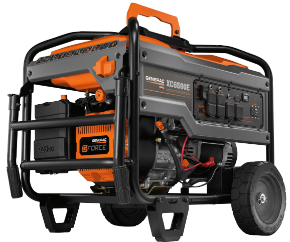
Photograph may not represent actual content.

AC Rated Output Running Watts 6500 AC Maximum Output Starting Watts 8125