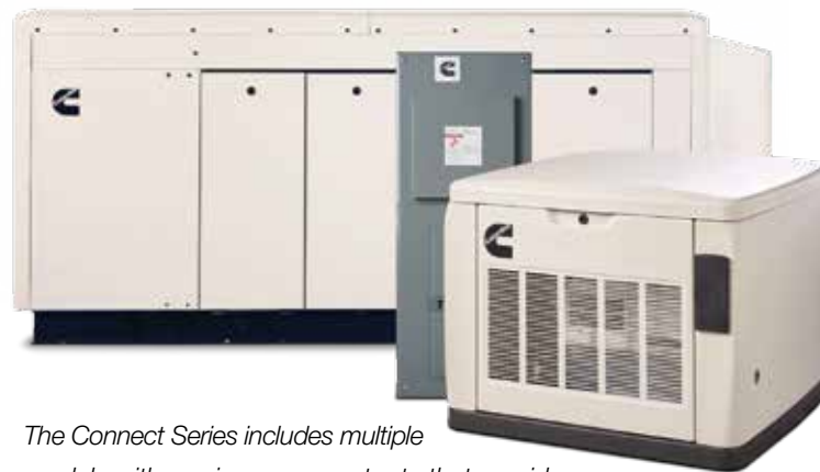
The Connect Series includes multiple models with varying power outputs that provide reliable backup, regardless of your power needs. An Automatic Transfer Switch (ATS) is also available.

The Connect Series puts almost 100 years of proven Cummins reliability into a range of powerful backup solutions. Featuring advanced technology and design for nearly any home, large or small, these quiet, compact generators allow your life to go on normally even during an outage.