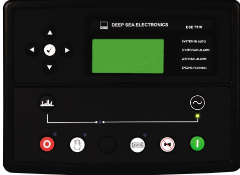
Pictures of Control Panel RH and Distribution Panel LH may include optional equipment and/or accessories