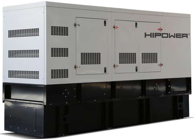
Generator depicted with sound attenuated option, some accessories for display only.