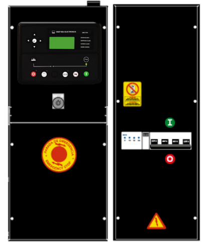
Pictures of Control Panel RH and Distribution Panel LH may include optional equipment and/or accessories

Alternator alarms included: Overload, unbalanced voltage, over voltage, under voltage, over frequency, under frequency, short circuit, reverse power, and incorrect phase sequence.