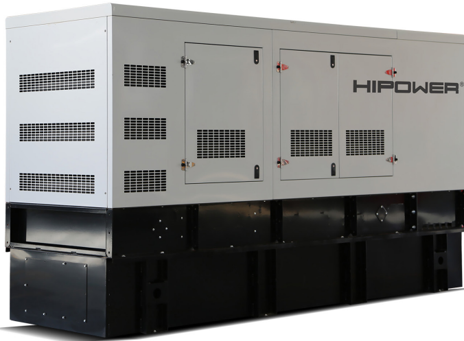
Generator depicted with sound attenuated option, some accessories for display only.