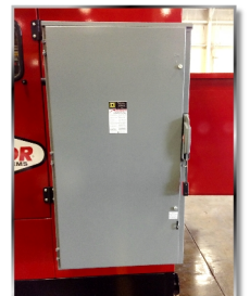
NEMA 3R Disconnect Box