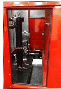
Vertical Fuel Scrubber with Auto Dump & Safety Shutdown