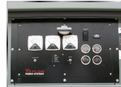
Analog Control Panel