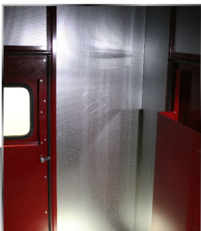
2" thick Roxul wool Insulation with Galvanneal perf liner