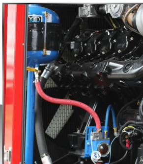
5 to 16 gallon oil reservoir with site glass regulator