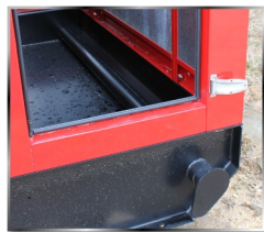
Teardrop Lifting Points extend full frame