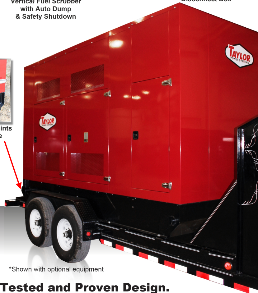
*Shown with optional equipment