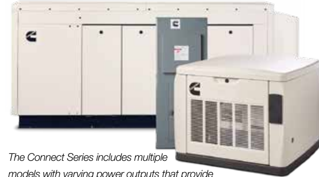
The Connect Series includes multiple models with varying power outputs that provide reliable backup, regardless of your power needs. An Automatic Transfer Switch (ATS) is also available.

The Connect Series puts almost 100 years of proven Cummins reliability into a range of powerful backup solutions. Featuring advanced technology and design for nearly any home, large or small, these quiet, compact generators allow your life to go on normally even during an outage.