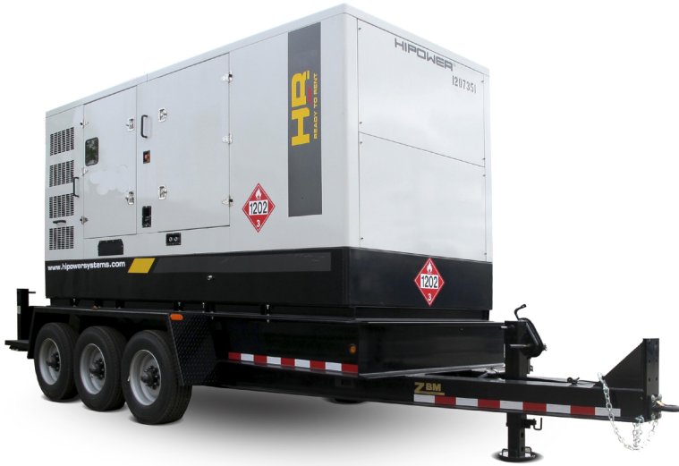
Photo depicts a typical model but may not include options such as trailer.