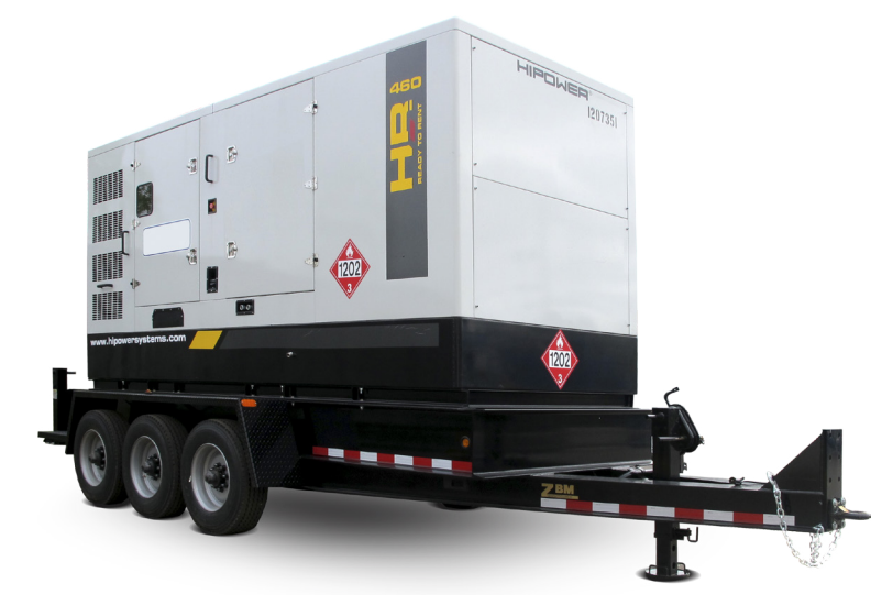
Photo depicts a typical model but may not include options such as trailer.