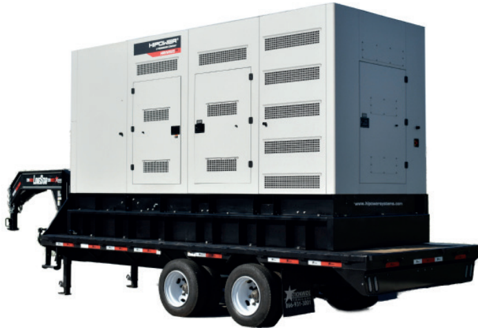
* Trailer is sold as option